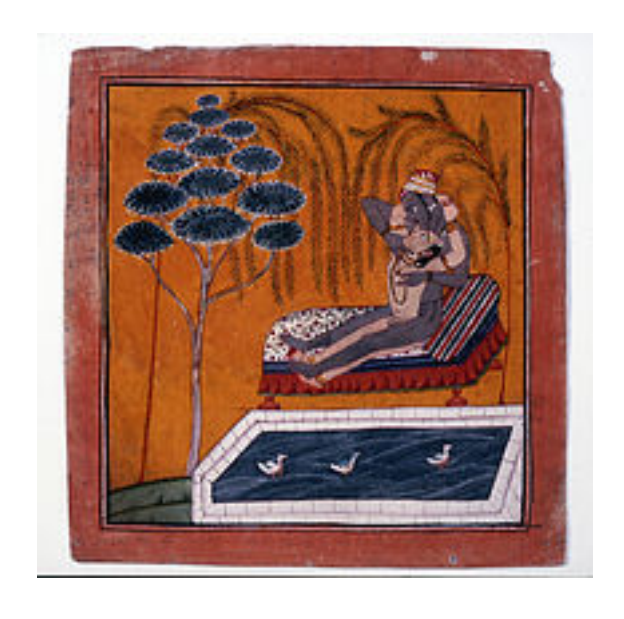
The Scandalous History of Sex Books July 1, 2017