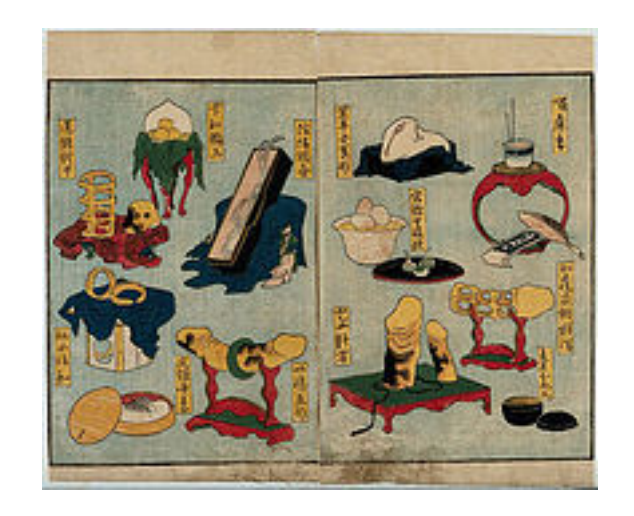
Evolution of Sex Toys: Operating heavy machinery July 1, 2017