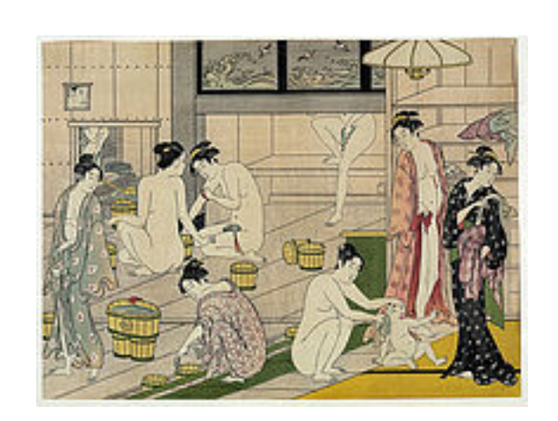
Brief History of Public Erotic Art July 1, 2017